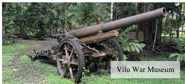
Vilu War Museum