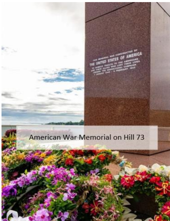
American War Memorial on Hill 73

Day 1-3: Depart LAX and lose a day crossing the international date line. Arrive and overnight in Fiji. Visit Momi Battery. Depart Fiji.