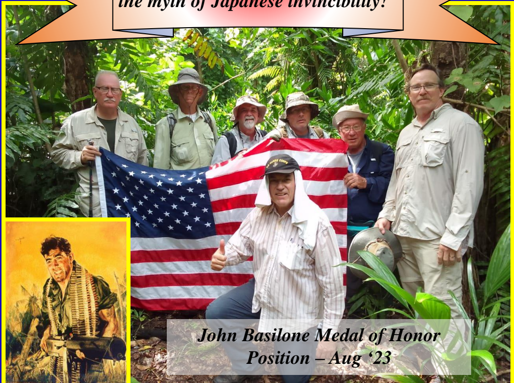
John Basilone Medal of Honor Position – Aug '23

“The Allied victory that destroyed the myth of Japanese invincibility!”